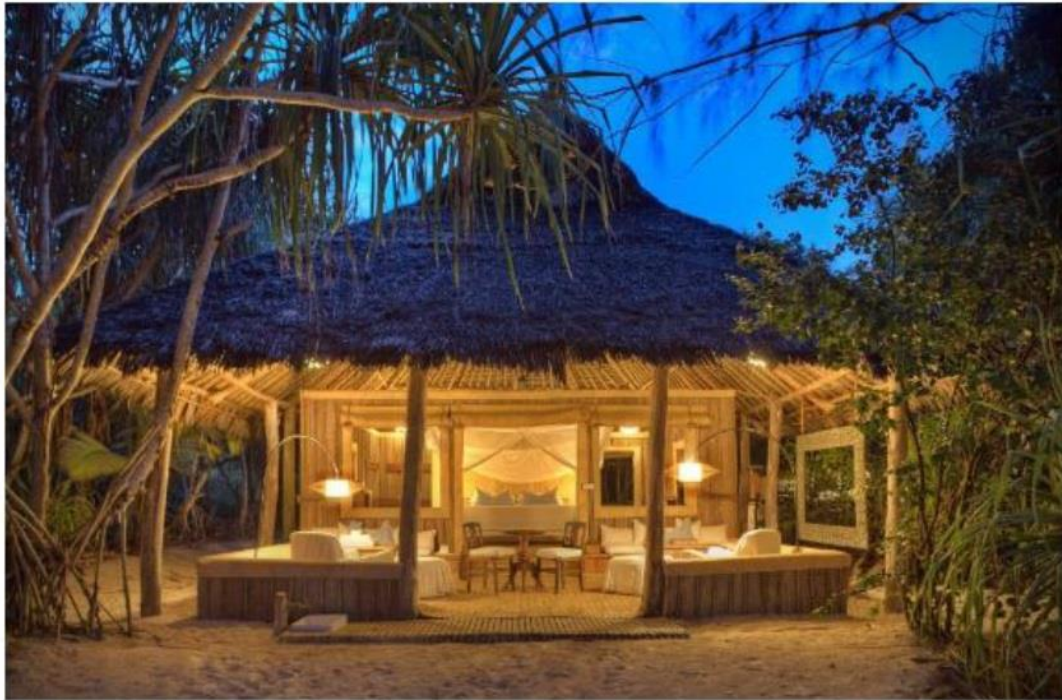
Top 12 Exclusive Private Islands Around the World | Mnemba Island – Zanzibar