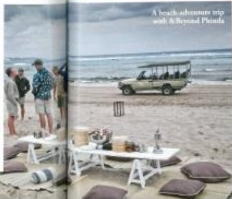
A beach adventure trip with &Beyond Phinda