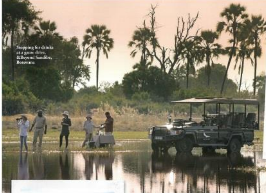
Stopping for drinks at a game drive, &Beyond Sandibe, Botswana