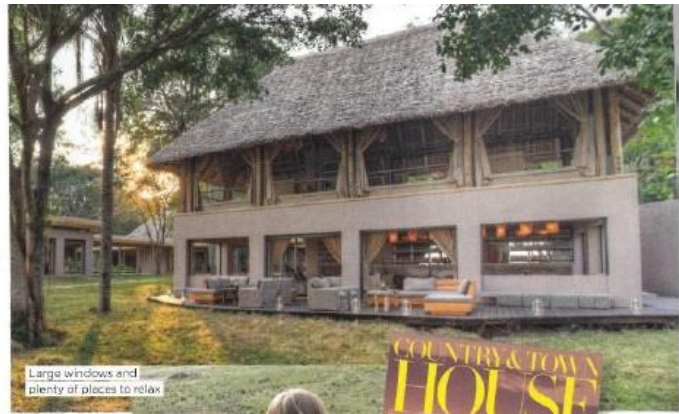
Large windows and plenty of places to relax

Next door to Kichwa, andBeyond is currently refurbishing the iconic Bateleur Camp, which is due to be finished in June 2018. Expect to see built-in day beds on private verandas, as well as bathtubs and alfresco showers. Two new swimming pools will be a welcome addition as well as a fitness centre. All refurbishment has been carefully planned to retain the authentic village safari atmosphere, while enhancing its sense of intimacy and luxury.