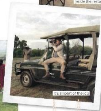
It's all part of the job