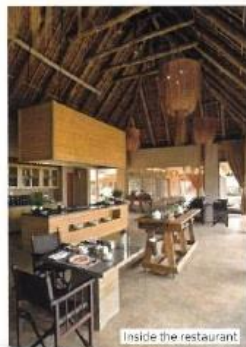
Inside the restaurant