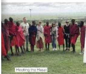
Meeting the Masai

The team travelled to Kereya with andBeyond and stayed at andBeyond Kichwa Tembo Tented Camp. Prices start from USD$330pp per night. andbeyond.com